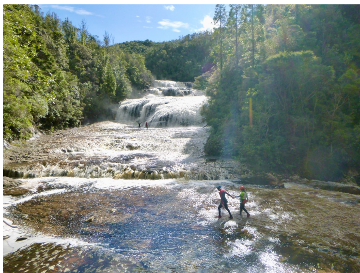
The magnificent 25m wide, three waterfalls section, up stream (lower gorge)

Lots of escapes possible from the Bulls run stream. Escapes before entering the bottom of lower gorge itself are possible. You could bail out at river left and hike out over the hill - Once committed below the large jammed log, there are no escapes until after the 22m waterfall, especially in high flow!!