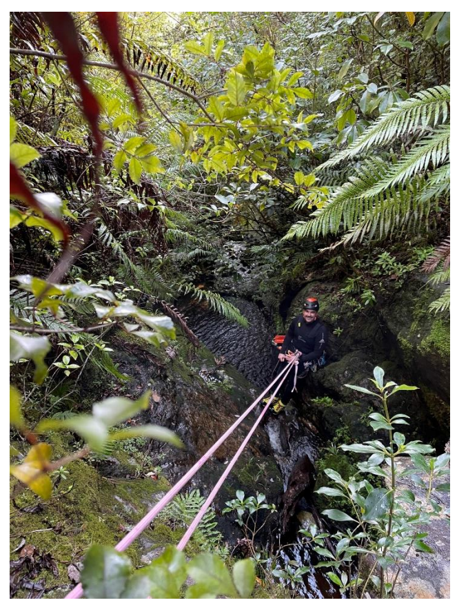
Rappel in upper section