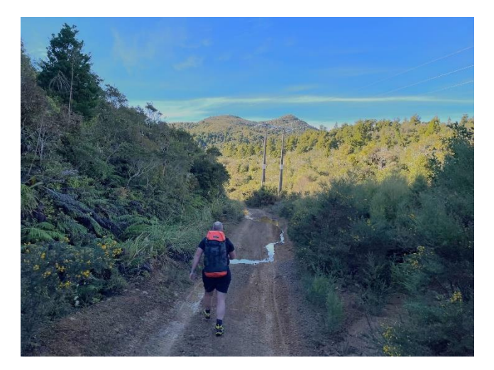
Following the 4WD track to Neavesville. This is used by the power line maintenance crews.