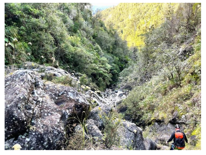
60m waterfall – unfortunately just a wide cascade which you can climb down