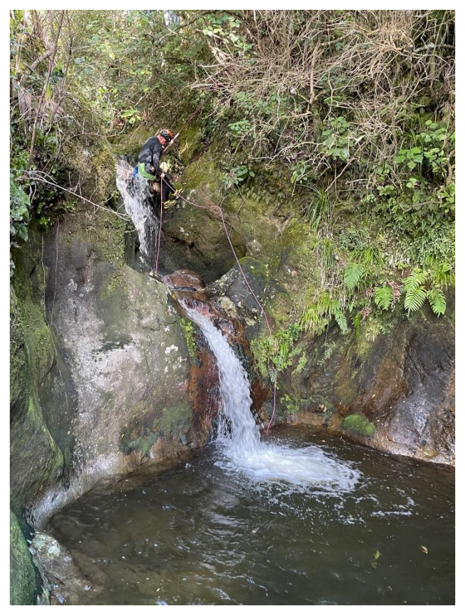
Rappel in upper section