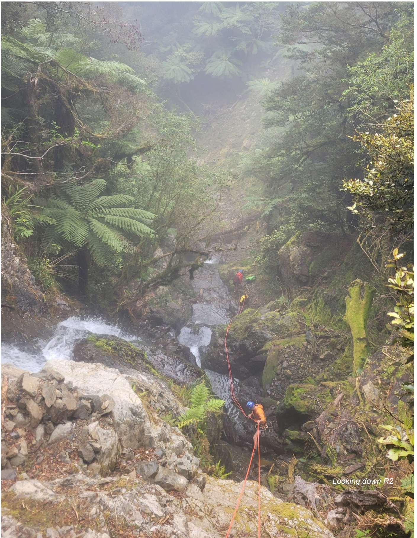
Looking down R2