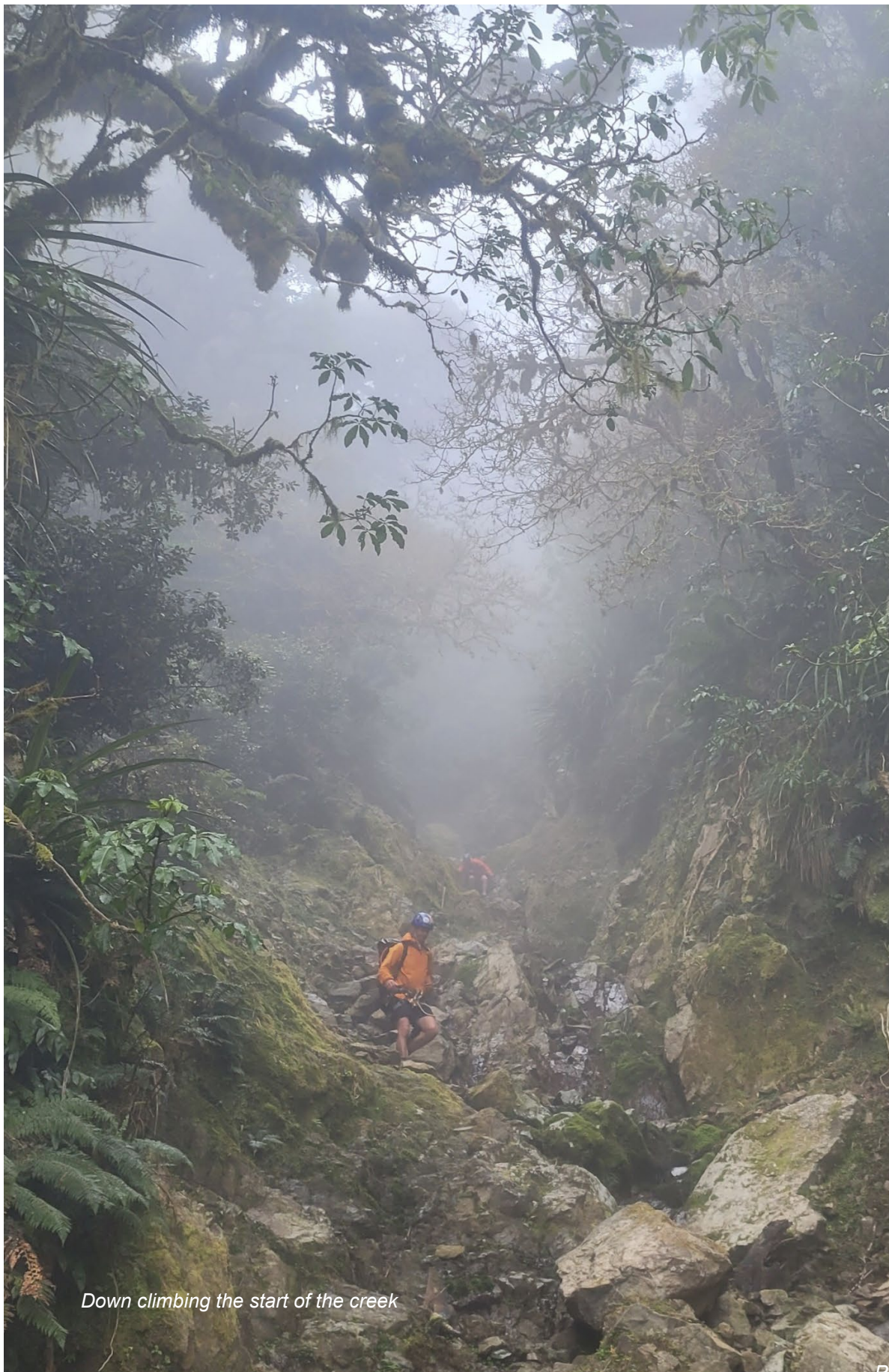
Down climbing the start of the creek