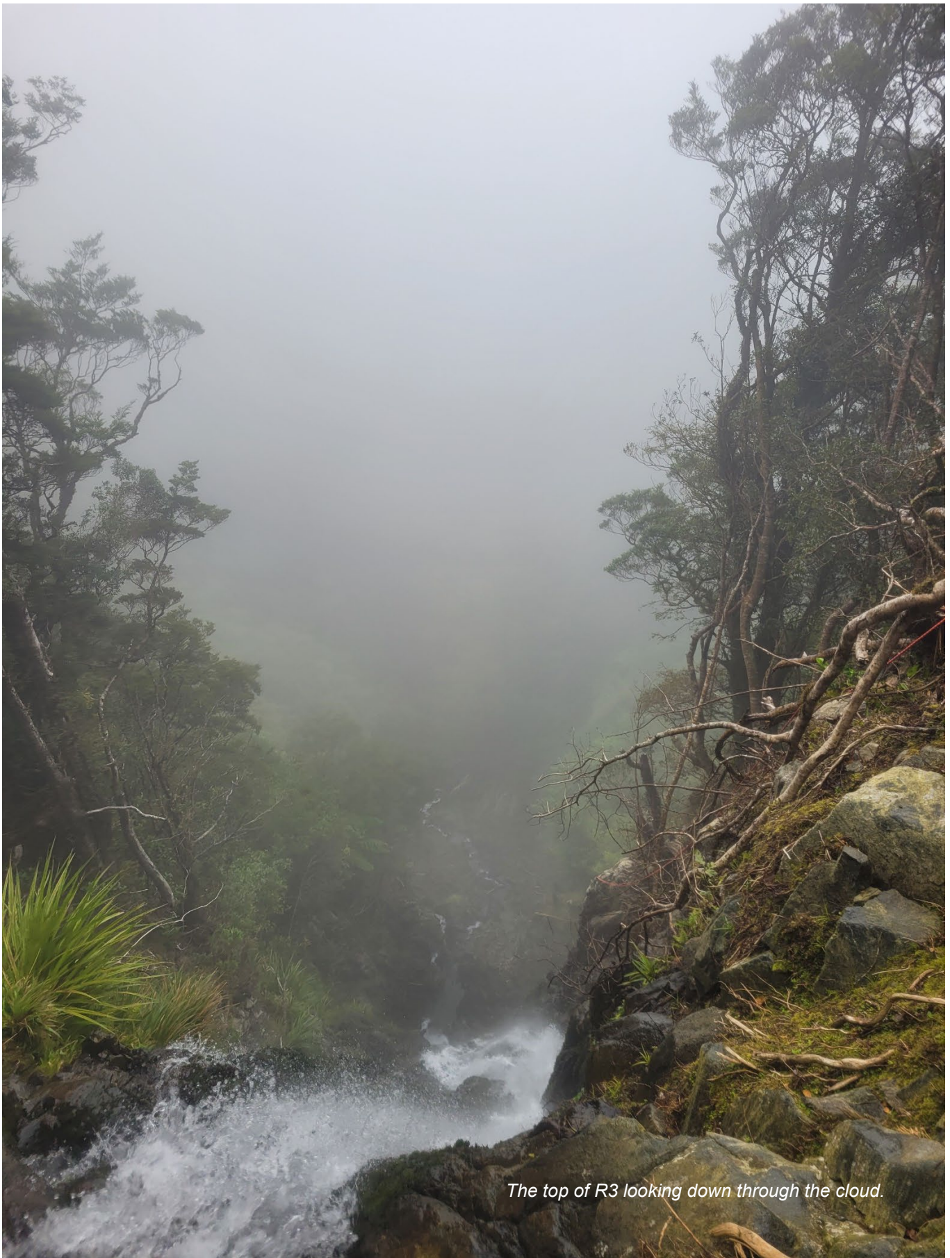
The top of R3 looking down through the cloud.